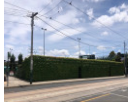
489 Glenferrie Road, Toorak