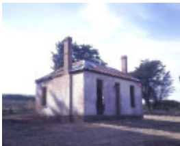
former brinds distillery old melbourne road dunnstown bond store managers residence she project 2003