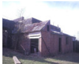
former brinds distillery old melbourne road dunnstown generator shed she project 2003