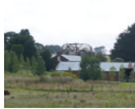
FORMER BRIND'S DISTILLERY SOHE 2008