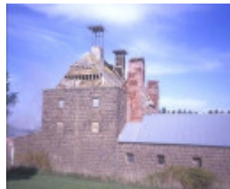
former brinds distillery old melbourne road dunnstown main building roof she project 2003