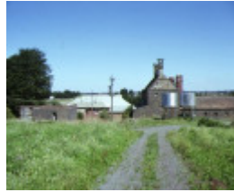
1 former distillery old melbourne road dunnstown property view