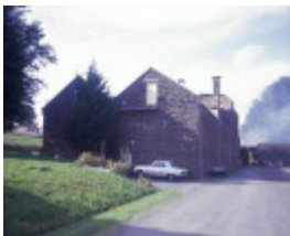
former brinds distillery old melbourne road dunnstown main building west side she project 2003