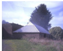
former brinds distillery old melbourne road dunnstown murphys stables she project 2003