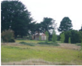
FORMER BRIND'S DISTILLERY SOHE 2008