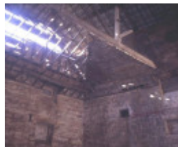
former brinds distillery old melbourne road dunnstown roof main building she project 2003