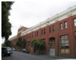
PART OF FORMER FOY AND GIBSON COMPLEX SOHE 2008