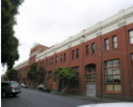
PART OF FORMER FOY AND GIBSON COMPLEX SOHE 2008