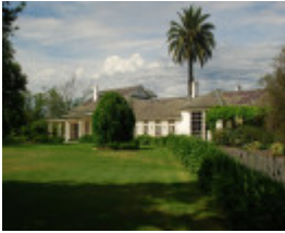
CHATEAU YERING SOHE 2008