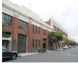
PART OF FORMER FOY AND GIBSON COMPLEX SOHE 2008