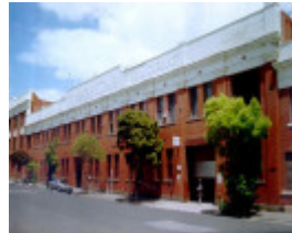
1 part of foy & gibson oxford street collingwood side view dec1997