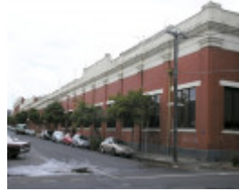
PART OF FORMER FOY AND GIBSON COMPLEX SOHE 2008