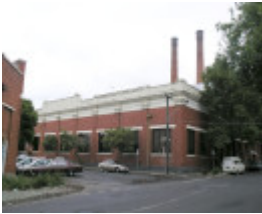
PART OF FORMER FOY AND GIBSON COMPLEX SOHE 2008