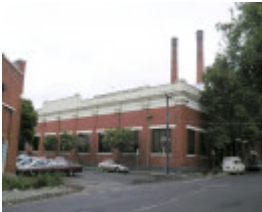
PART OF FORMER FOY AND GIBSON COMPLEX SOHE 2008