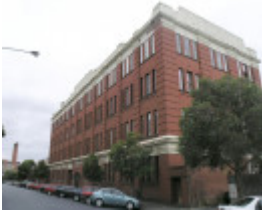
PART OF FORMER FOY AND GIBSON COMPLEX SOHE 2008