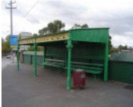
HO365 Tram Shelter