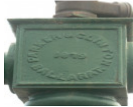
Detail of Standpipe Haddon