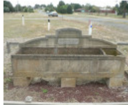
Detail of Horse trough Haddon