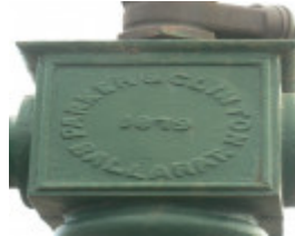
Detail of Standpipe Haddon