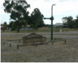
Stand pipe and horse trough, junction of Ross Creek - Haddon Road and School Road, Haddon