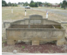
Detail of Horse trough Haddon