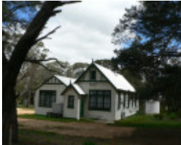
Former State School Illabarook -Berringa Road Berringa