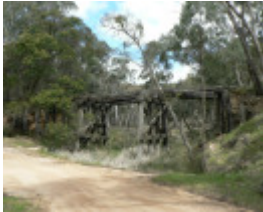
Mt Misery Creek Trestle Bridge, Berringa