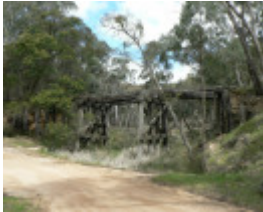
Mt Misery Creek Trestle Bridge, Berringa