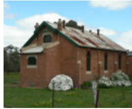
St Aidan's Church Berringa - details