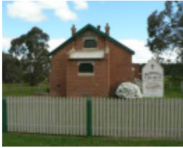
St Aidans Church of England, Berringa