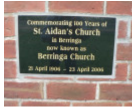
St Aidan's Church Berringa - details