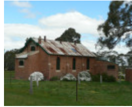
St Aidan's Church Berringa - details