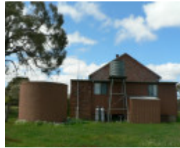
St Aidan's Church Berringa - details