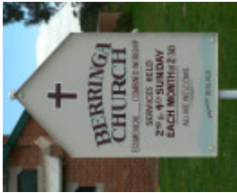
St Aidan's Church Berringa - details