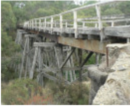
Detail of Springdallah Bridge Linton Pigoreet Road