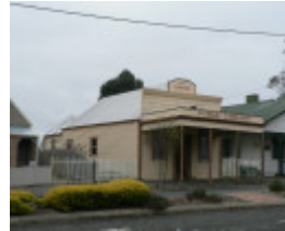
Linton Public Library 67 Sussex St Linton, exterior