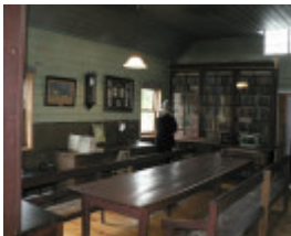
Linton Public Library 67 Sussex St Linton, interior