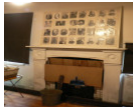
Linton Public Library 67 Sussex St Linton, living room mantel piece