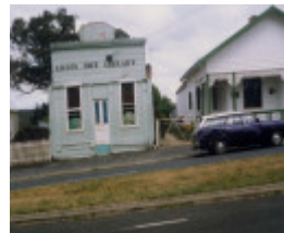
Linton Public Library c.1986.