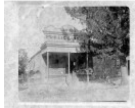
Linton Public Library, n.d