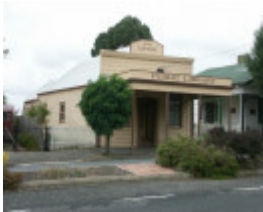
Linton Historical Society 2012