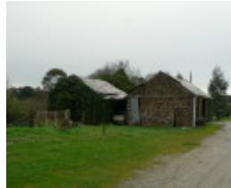
Piggoreet West Homestead Stables & Barn