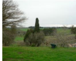
Piggoreet West Homestead front garden looking north east