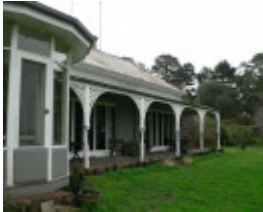
Piggoreet West Homestead viewed from the south east