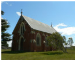
St Patricks Catholic Church Springdallah