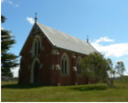
St Patricks Catholic Church Springdallah