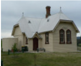
Former Garibaldi School, Hardies Hill Road