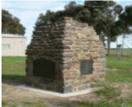
WW1 and WW2 Memorial Wallinduc