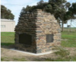
WW1 and WW2 Memorial Wallinduc