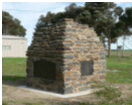
WW1 and WW2 Memorial Wallinduc