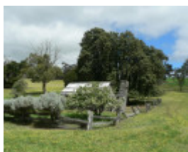
Naringal Slab Hut