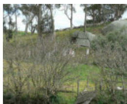
Naringal Slab Hut