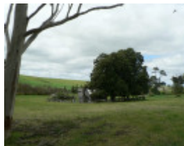
Naringal Slab Hut