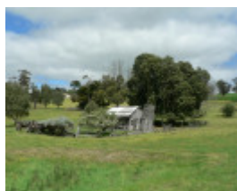
Naringal Slab Hut