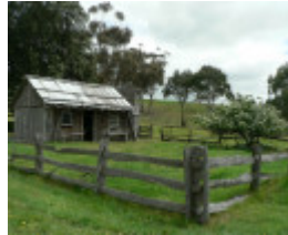
Naringal Slab Hut