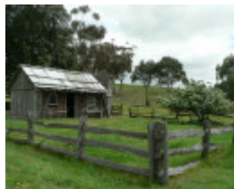
Naringal Slab Hut