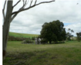
Naringal Slab Hut