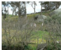
Naringal Slab Hut