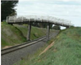
Timber railway bridge Peel Road Inverleigh