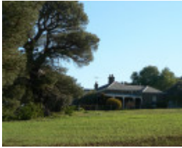
Presbyterian Manse Shelford