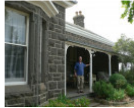
31711 Presbyterian Manse Shelford 195