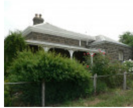
31711 Presbyterian Manse Shelford 197