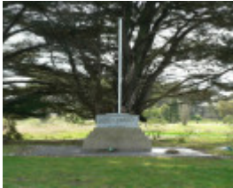
Teesdale War Memorial Bridge Street, Teesdale