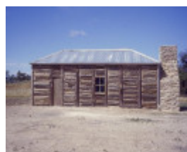
h00688 kow plains homestead cowangle cookhouse she project 2003