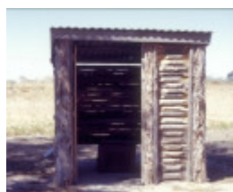
h00688 kow plains homestead cowangle privy she project 2003