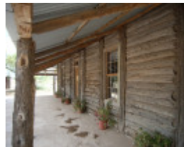
KOW PLAINS HOMESTEAD SOHE 2008