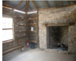
KOW PLAINS HOMESTEAD SOHE 2008