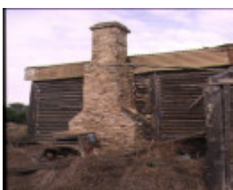
cow plains homestead cowangle side view of homestead with chimney