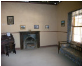
KOW PLAINS HOMESTEAD SOHE 2008