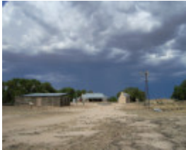
KOW PLAINS HOMESTEAD SOHE 2008