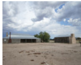
KOW PLAINS HOMESTEAD SOHE 2008