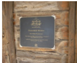
KOW PLAINS HOMESTEAD SOHE 2008