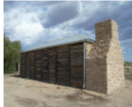
KOW PLAINS HOMESTEAD SOHE 2008