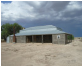
KOW PLAINS HOMESTEAD SOHE 2008