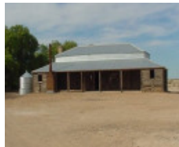
h00688 kow plains homestead restoration 2002