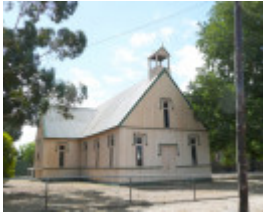
FORMER ST PAULS CHURCH OF ENGLAND SOHE 2008