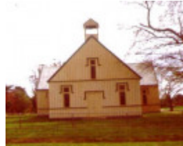
1 st pauls anglican church hall clunes front view ms sept 99