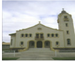
1 holy spirit church bostock avenue manifold heights front view apr1997