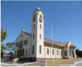
HOLY SPIRIT CHURCH SOHE 2008