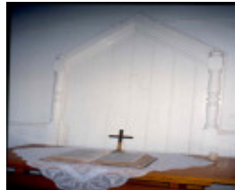
H02010 former weslyan chapel box hill interior