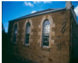
H02010 former weslyan chapel box hill west side