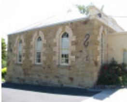
FORMER WESLEYAN CHAPEL SOHE 2008