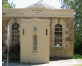
FORMER WESLEYAN CHAPEL SOHE 2008