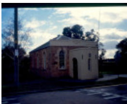
Box Hill Wesleyan Chapel Exterior