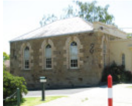
FORMER WESLEYAN CHAPEL SOHE 2008