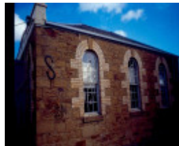
Box Hill Wesleyan Chapel Exterior