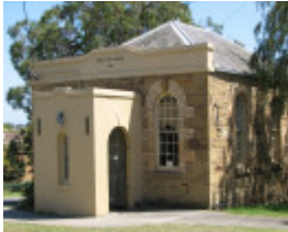
FORMER WESLEYAN CHAPEL SOHE 2008