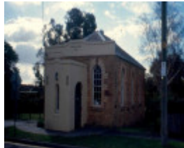
H02010 1former weslyan chapel box hill