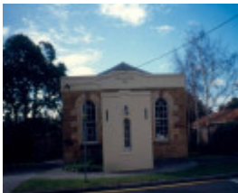
H02010 former weslyan chapel box hill front