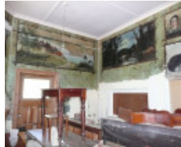
FORMER CHARLIE NAPIER HOTEL SOHE 2008