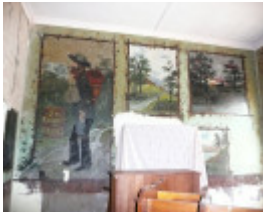
FORMER CHARLIE NAPIER HOTEL SOHE 2008