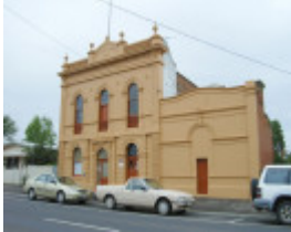
FORMER CHARLIE NAPIER HOTEL SOHE 2008