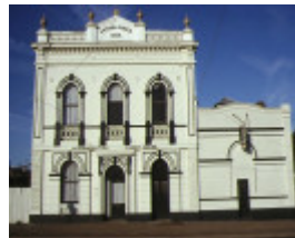
1 former charlie napier hotel brooke street inglewood front view