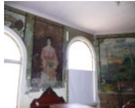
FORMER CHARLIE NAPIER HOTEL SOHE 2008