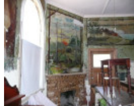
FORMER CHARLIE NAPIER HOTEL SOHE 2008