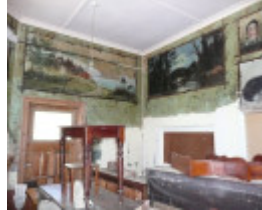
FORMER CHARLIE NAPIER HOTEL SOHE 2008