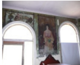
FORMER CHARLIE NAPIER HOTEL SOHE 2008