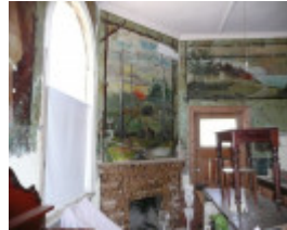
FORMER CHARLIE NAPIER HOTEL SOHE 2008