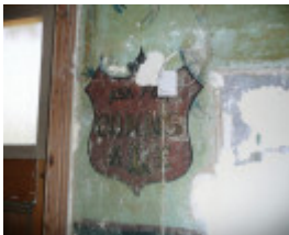
FORMER CHARLIE NAPIER HOTEL SOHE 2008