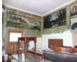
FORMER CHARLIE NAPIER HOTEL SOHE 2008