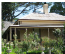
FRIEDENSRUH SOHE 2008