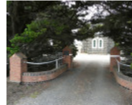
ST DAVID'S LUTHERAN CHURCH AND CEMETERY SOHE 2008