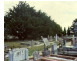
1 st davids freshwater ac2 june00