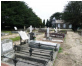
ST DAVID'S LUTHERAN CHURCH AND CEMETERY SOHE 2008