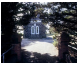
h01903 st davids lutheran church and cemetery anglesea rd freshwater creek front view she project 2003