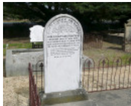
ST DAVID'S LUTHERAN CHURCH AND CEMETERY SOHE 2008