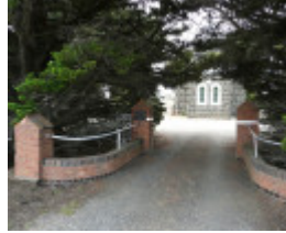
ST DAVID'S LUTHERAN CHURCH AND CEMETERY SOHE 2008