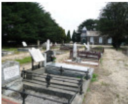
ST DAVID'S LUTHERAN CHURCH AND CEMETERY SOHE 2008