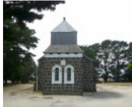
ST DAVID'S LUTHERAN CHURCH AND CEMETERY SOHE 2008