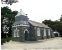
ST DAVID'S LUTHERAN CHURCH AND CEMETERY SOHE 2008