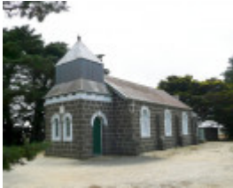
ST DAVID'S LUTHERAN CHURCH AND CEMETERY SOHE 2008