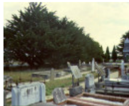
1 st davids freshwater ac2 june00