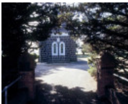
h01903 st davids lutheran church and cemetery anglesea rd freshwater creek front view she project 2003