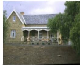
1 holy trinity anglican church merrawarp road ceres vicarage front view