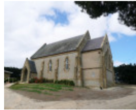
HOLY TRINITY ANGLICAN CHURCH AND VICARAGE SOHE 2008