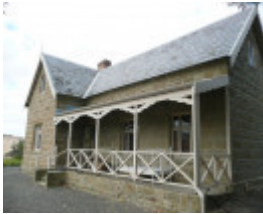
HOLY TRINITY ANGLICAN CHURCH AND VICARAGE SOHE 2008