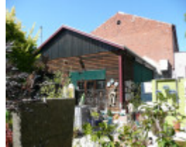
WINTERGARDEN SOHE 2008