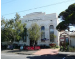
WINTERGARDEN SOHE 2008