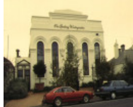
1 congregational church mckillop street geelong front view jun1995