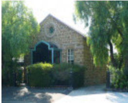
FORMER GAELIC CHURCH AND SCHOOLHOUSE SOHE 2008