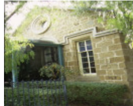
1 former gaelic church & schoolhouse geelong front entrance apr1997