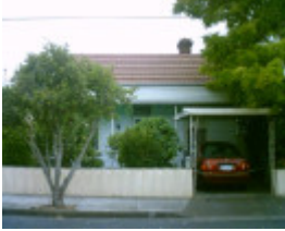
18 Mc Dougall Street, Geelong West