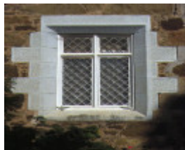
coriyule homestead mcdermott road drysdale detail of stone framed window