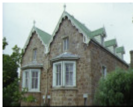
1 coriyule homestead drysdale side view of homestead