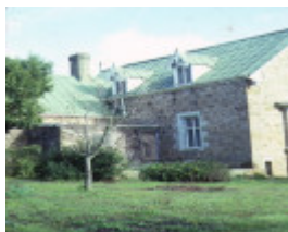
coriyule homestead mcdermott road drysdale view of top floor