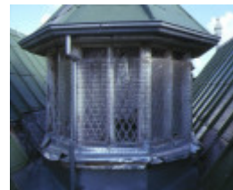
coriyule homestead mcdermott road drysdale enclosed glass room on roof