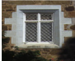
coriyule homestead mcdermott road drysdale detail of stone framed window