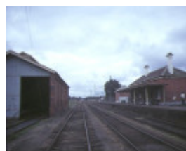
dunolly railway station track view aug1984