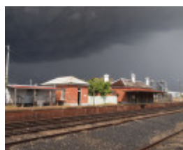
H1670 DUNOLLY RAILWAY STATION LHA 2015 1.JPG