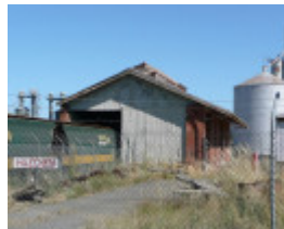
DUNOLLY RAILWAY STATION SOHE 2008