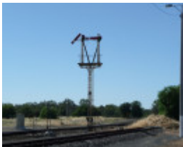
DUNOLLY RAILWAY STATION SOHE 2008