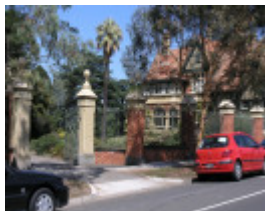
FORMER NORTH PARK SOHE 2008