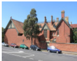
FORMER NORTH PARK SOHE 2008