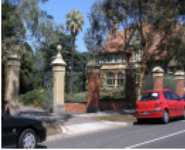
FORMER NORTH PARK SOHE 2008