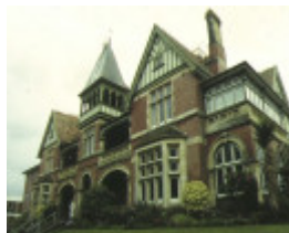
1 north park woodland street essendon front view sep1996