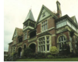
1 north park woodland street essendon front view sep1996