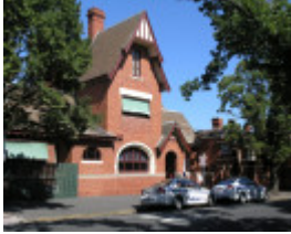
POLICE STATION AND LOCK-UP SOHE 2008