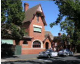
POLICE STATION AND LOCK-UP SOHE 2008