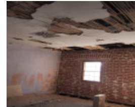
H0863 FORMER BENDIGO HOTEL LHA 2015 6.JPG