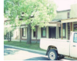
1 former bendigo hotel dunolly front view