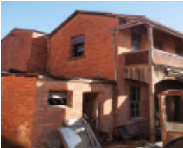
H0863 FORMER BENDIGO HOTEL LHA 2015 4.JPG