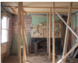
H0863 FORMER BENDIGO HOTEL LHA 2015 7.JPG