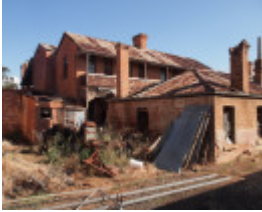
H0863 FORMER BENDIGO HOTEL LHA 2015 1.JPG