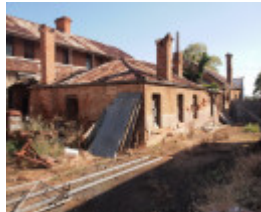
H0863 FORMER BENDIGO HOTEL LHA 2015 2.JPG