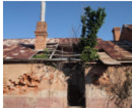
H0863 FORMER BENDIGO HOTEL LHA 2015 5.JPG