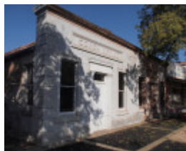
H0863 FORMER BENDIGO HOTEL LHA 2015 8.JPG