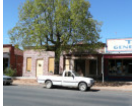
FORMER BENDIGO HOTEL SOHE 2008