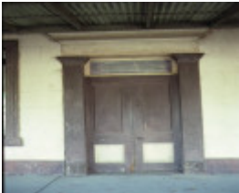
former bendigo hotel dunolly front entrance