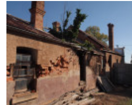
H0863 FORMER BENDIGO HOTEL LHA 2015 3.JPG