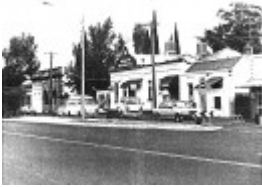
Buildings on Eaglehawk Road, California Gully