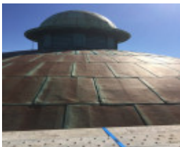
Before Photographs - Reference F3883 2014