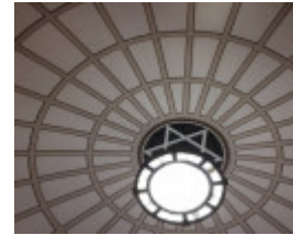
After Photographs - Reference F3883 2016