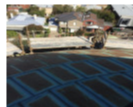
During Photographs - Reference F3883 2015