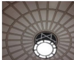
After Photographs - Reference F3883 2016