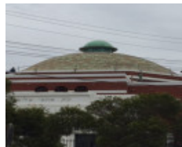
After Photographs - Reference F3883 2016