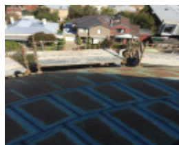
During Photographs - Reference F3883 2015