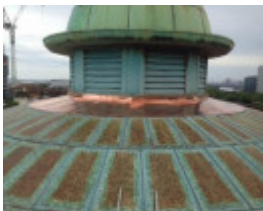
After Photographs - Reference F3883 2016