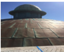
Before Photographs - Reference F3883 2014