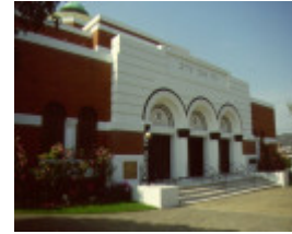
H01968 stkilda synagogue