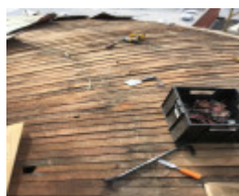
During Photographs - Reference F3883 2015