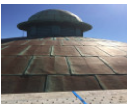
Before Photographs - Reference F3883 2014