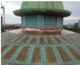
After Photographs - Reference F3883 2016