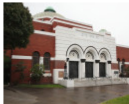
Before Photographs - Reference F3883 2014