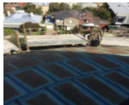
During Photographs - Reference F3883 2015