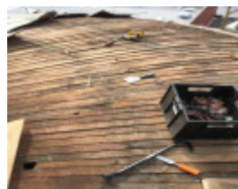
During Photographs - Reference F3883 2015