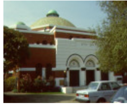
H01968 1 stkilda synagogue