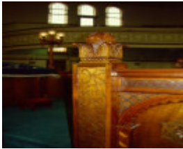
H01968 stkilda synagogue detail bimah