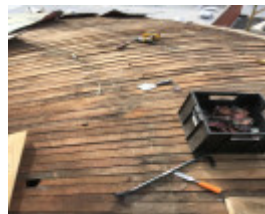
During Photographs - Reference F3883 2015