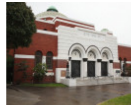
Before Photographs - Reference F3883 2014