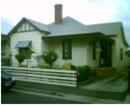
22 Albert Street, Geelong West