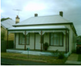
51 Clarence Street, Geelong West