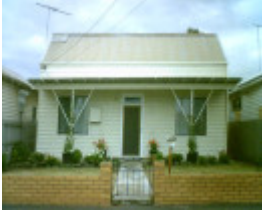
16 Avon Street, Geelong West