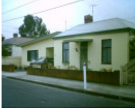
20 Mc Dougall Street, Geelong West - Units