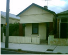
85 Alberts Street, Geelong West