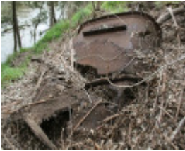
Skip on south side of Latrobe River