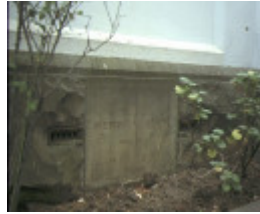
new temple church north east corner of albert street east melbourne memorial stone oct1990