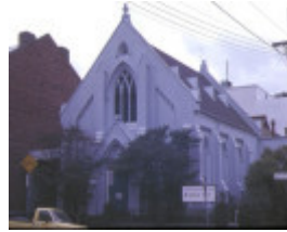
1 new temple church north east corner of albert street east melbourne frotn view sep1981