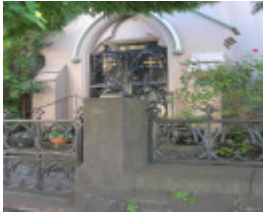
NEW TEMPLE CHURCH SOHE 2008