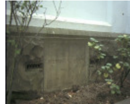
new temple church north east corner of albert street east melbourne memorial stone oct1990