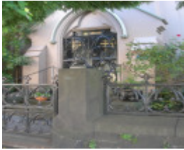
NEW TEMPLE CHURCH SOHE 2008