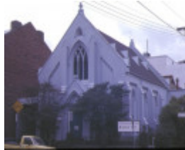
1 new temple church north east corner of albert street east melbourne frotn view sep1981