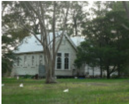
Former Corindhap State School No.1906