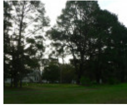
Former Corindhap State School No.1906