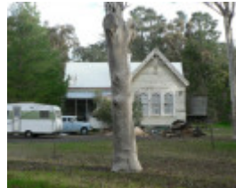
Former Corindhap State School No.1906