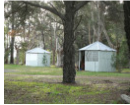
Former Corindhap State School No.1906