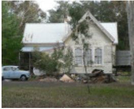
Former Corindhap State School No.1906