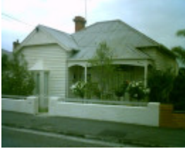
112 Clarence Street, Geelong West