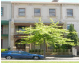
TERRACE SOHE 2008