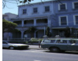
1 terrace 408 albert street east melbourne front view nov1990