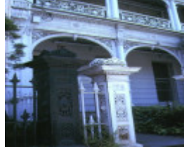
terrace 408 albert street east melbourne front entrance nov1990