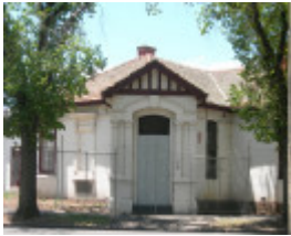
QUEEN ELIZABETH MATERNAL AND CHILD HEALTH CENTRE SOHE 2008