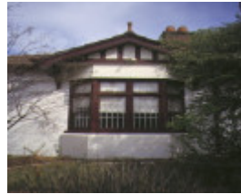
1 former carlton refuge keppel street carlton 1907 building