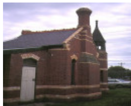
1 st albans homestead gate lodge whittington side view may1995