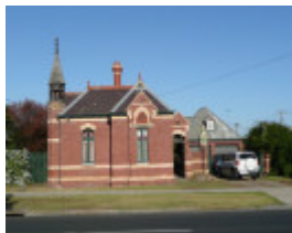
ST ALBANS HOMESTEAD GATE LODGE SOHE 2008