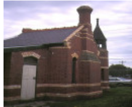
1 st albans homestead gate lodge whittington side view may1995