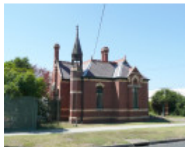
ST ALBANS HOMESTEAD GATE LODGE SOHE 2008